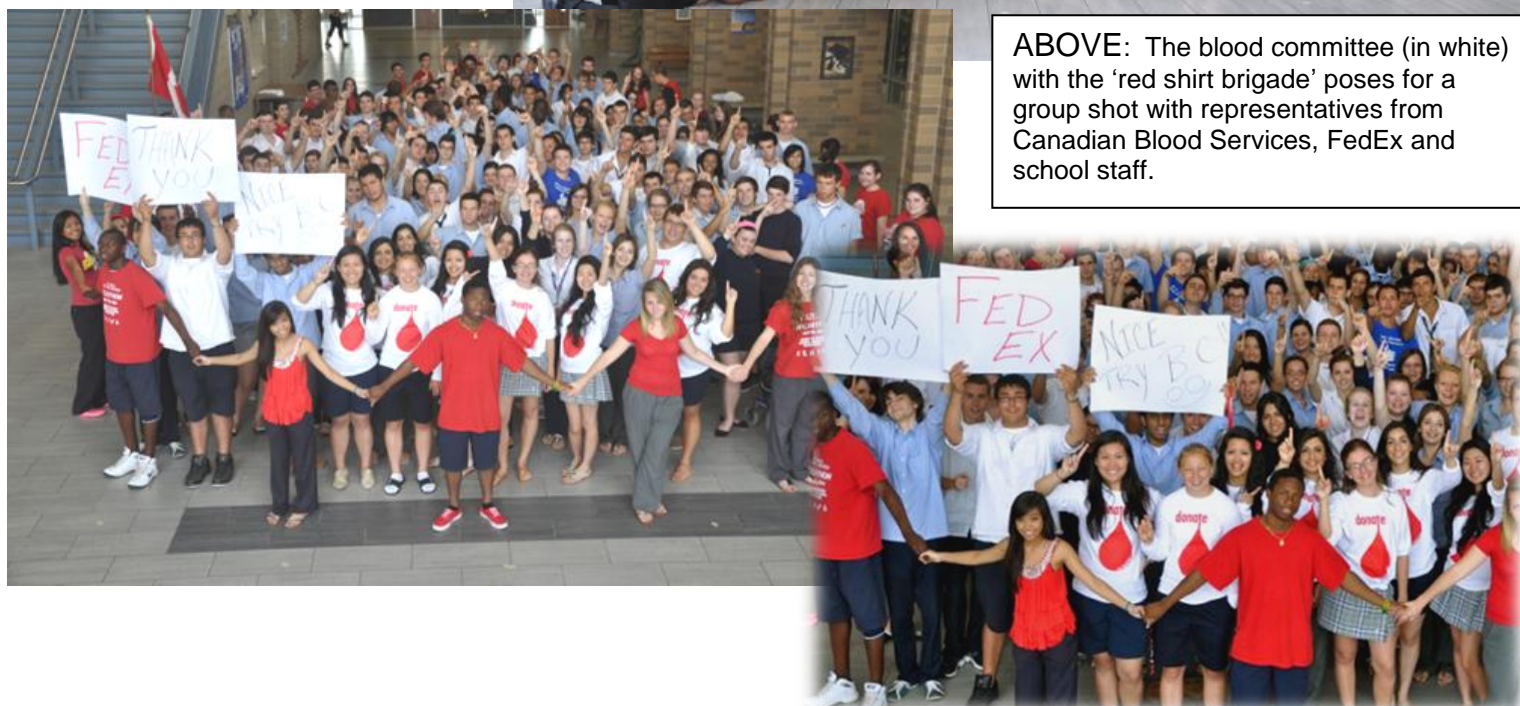
ABOVE and RIGHT: 160 of St. Joseph's blood donors gather to form a giant a 'blood drop' to celebrate their accomplishment and for a friendly taunt to their rivals in British Columbia.