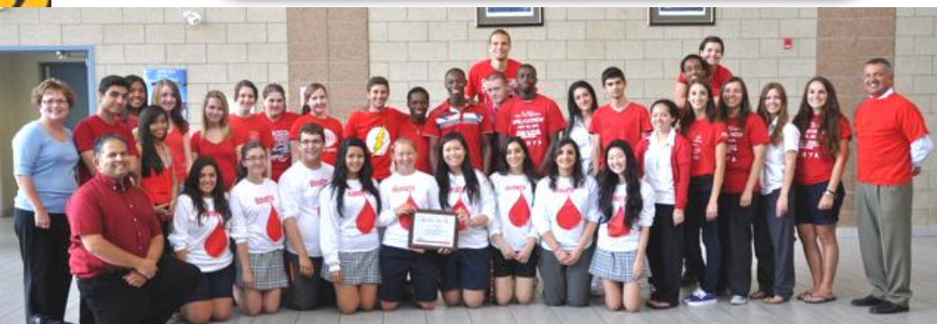
ABOVE: The blood committee (in white) with the 'red shirt brigade' poses for a group shot with representatives from Canadian Blood Services, FedEx and school staff.